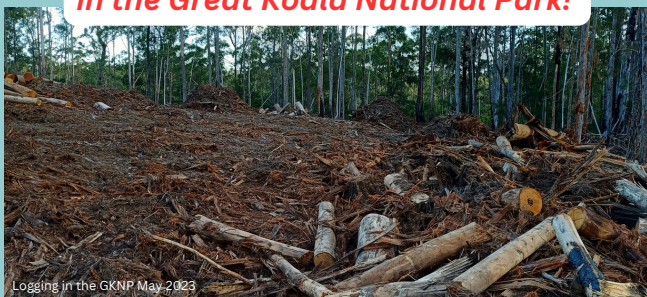
Logging in the GKNP May-2023

The NSW Government is refusing to stop intensively logging critical koala habitat in the Great Koala National Park!